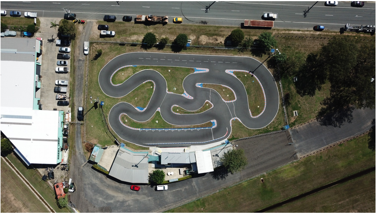
Overhead Track View