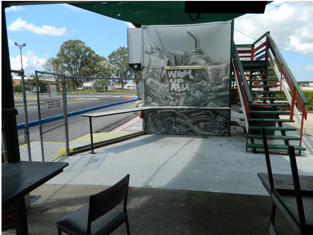
Track-side Mechanics Pit Area Below Drivers Sta